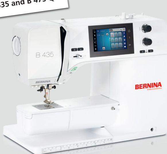
B 435 and B 475 QE

Talented. Energetic. Creative. Bold. A maker like Tiffany relies on the B 435 and B 475 QE to be powerful, easy to handle, fast and magical. Day in and day out. And her BERNINA never fails to deliver. She loves it and you will too.