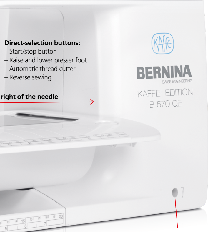
BERNINA Free Hand System (FHS)